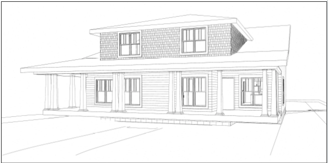
Above: Composite sketch of the rented duplex that will be occupied by 14 brothers of Sigma Phi next fall.

The Challenges and Successes of a few Excellent Gentlemen