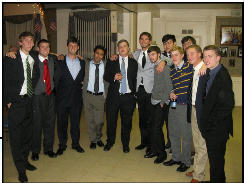
Left and Below: Brothers from around the country pose at the Geneva Convention