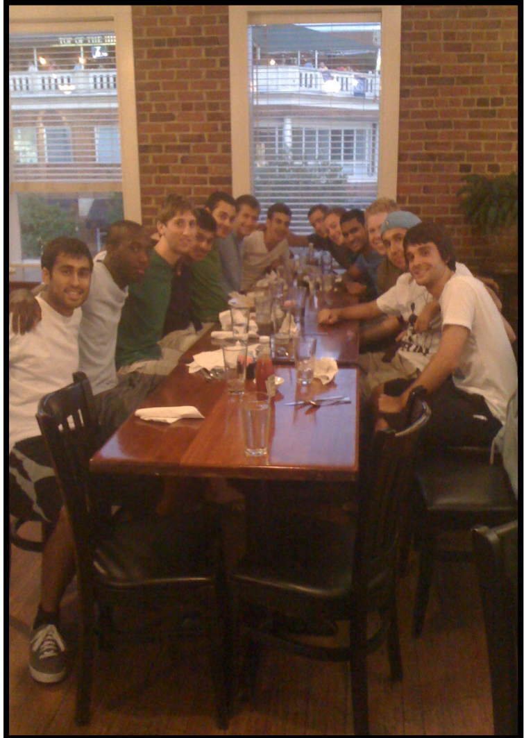
Above: The brothers catch up after an adventurous summer at a local burger joint called "Spanky's".